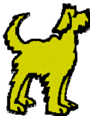
Keep pets and neighbors safe by using a leash.

Each state, including Indiana, has passed laws specifically pertaining to animals and their owners. The following law applies to Indiana residents and is enforced by local animal control officers, as well as state and local law enforcement agencies. Contact your local law enforcement agency or the Marion County Animal Ser-